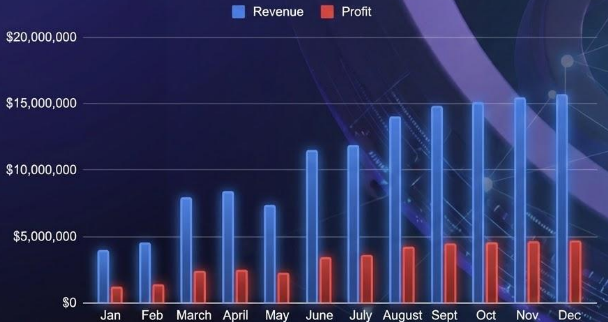
Annualized Revenue and Annualized Profit